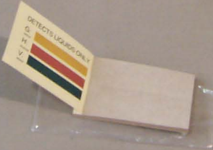
(CS) CHEMICAL AGENT DETECTOR PAPER