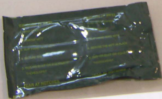
(M295) DECON KIT: INDIVIDUAL