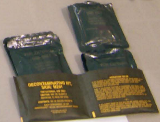
(M291) SKIN DECON KITS