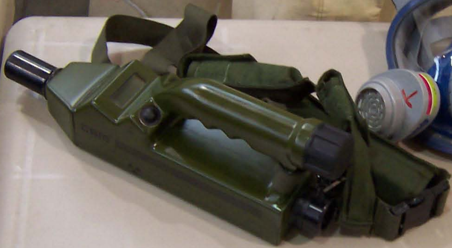
(CAM) CHEMICAL AGENT MONITOR