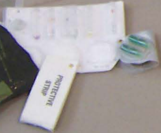
(M265A1) CHEMICAL AGENT DETECTOR KIT